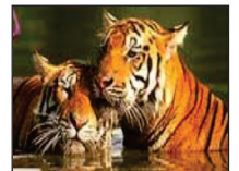
Wild Life, Corbett