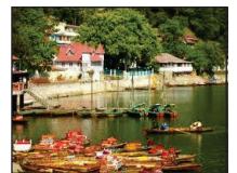
Naini Lake Temple