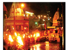
Ganga Aarti, Gangotri