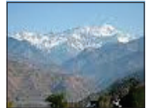
Snow Capped Mountains Barkot