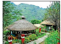
Camp in Joshimath