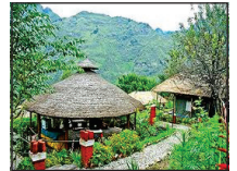
Camp in Joshimath