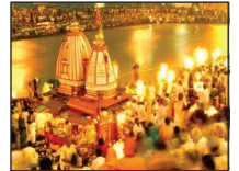
Har ki Pauri, Haridwar

Departure to Delhi to board Train / Air or for further schedule.