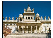
Jaswant Thada, Jodhpur