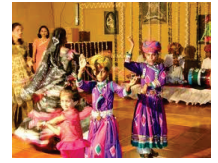
Chokhi Dhani, Jaipur

Check out from the hotel & take a transfer to Udaipur Airport / Falna Railway Station.