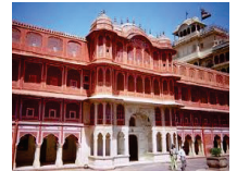
City Palace Museum