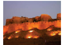
Golden fort, Jaisalmer