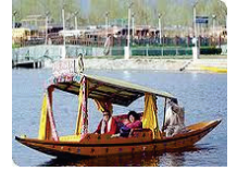
Shikara Ride, Dal Lake

Welcome to your 'Flavour of Kashmir' tour! On arrival at the Srinagar airport (on your own), you will be transferred to your hotel / houseboat. In the evening enjoy a romantic "shikara ride" gliding on the picturesque Dal lake.