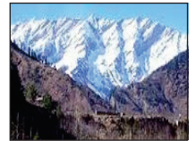
Pine-clad Mountains, Manali