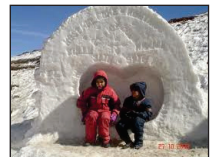
Rohtang Pass, Manali