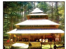
Hadimba Temple, Manali