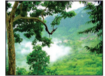
Dhauladhar ranges, Khajjiar