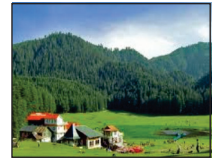
Mini Swiss, Khajjiar