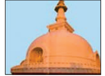
Budha Stupas, Patna