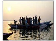
Boat ride in river Ganga, Varanasi